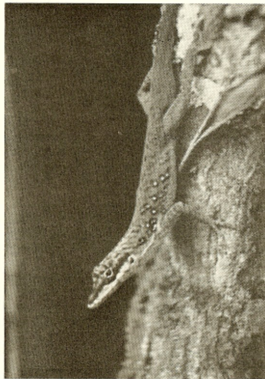
Fig. 1 — Anolis roquet summus , a subadult male in survey position on a tree trunk at Petite Savane.

2 plasmodia found in leucocytes in some infections